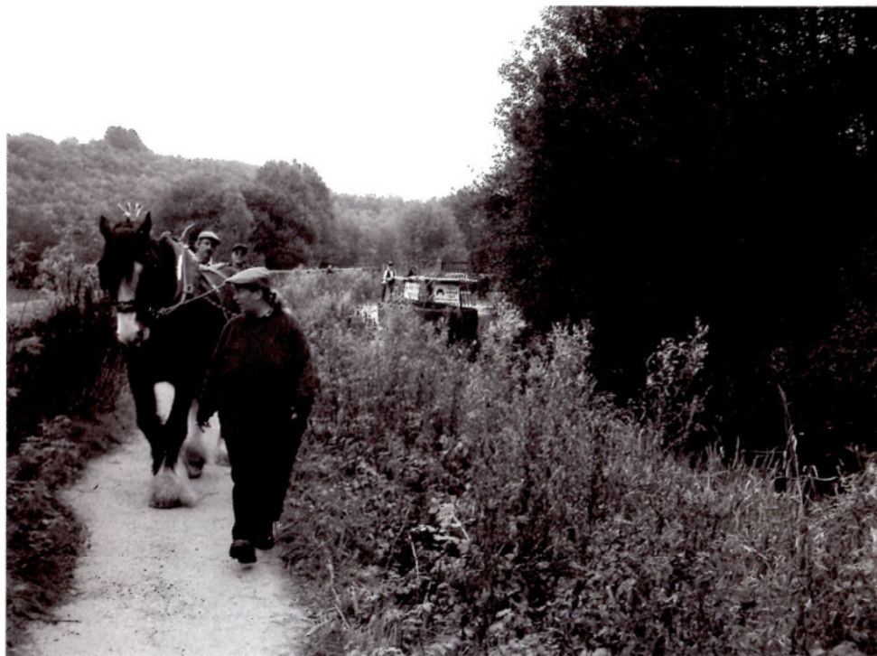
Rosie and boat on the way back from High Peak Junction