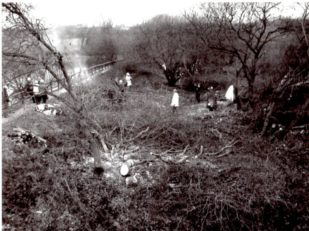
"CAUTION - Scrub Bashing in Progress!"