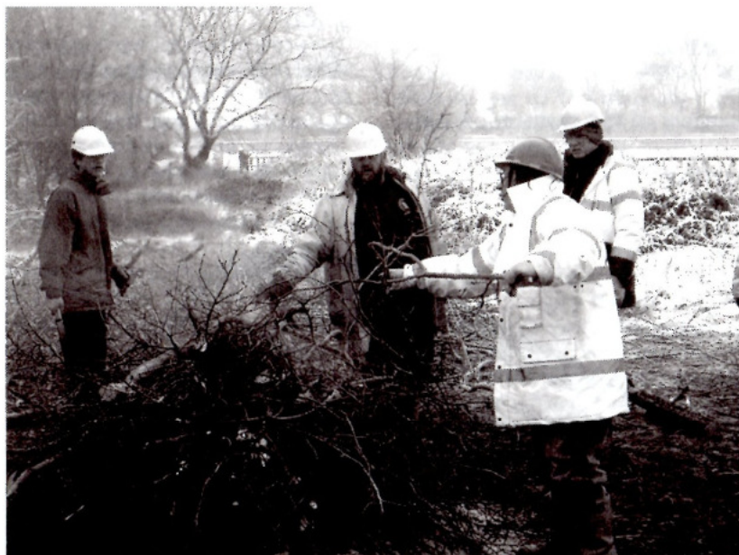
Serious discussions over a bonfire